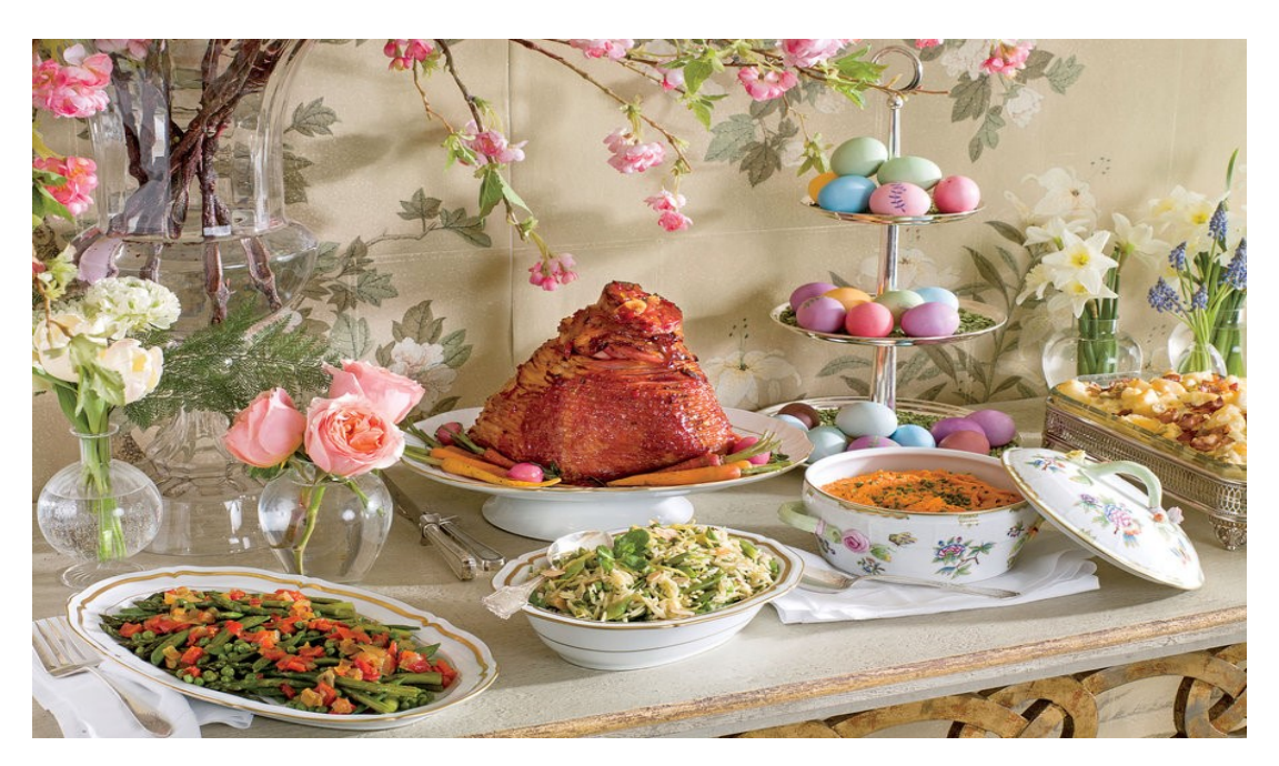
And don't forget... SPRING FLING SHOPPING THING!! <a href="http://www.amazon.com/?tag=saintandrewsguild-20">http://www.amazon.com/?tag=saintandrewsguild-20</a>

And feel better spending that money knowing that a small portion of it is going back to our favorite Royal Court Guild!