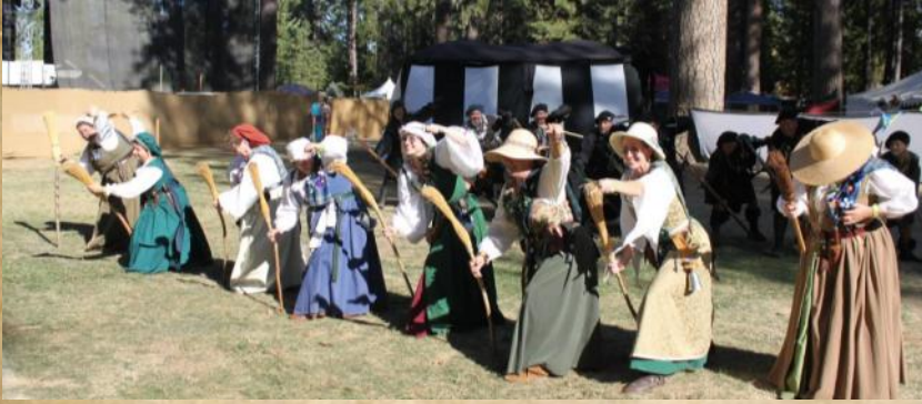
Highlanders Trouping with the Guard—KMVR Celtic Festival