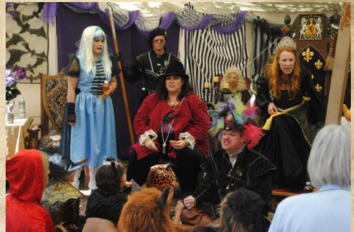
Mad Hatter Tea Party—All Hallows in Sonora