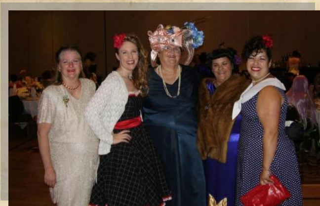
The Ladies were Gorgeous!

Appropriately enough the dance was kicked off with "The Time Warp" from The Rocky Horror Picture Show. Ironically, neither did Her Majesty or I plan our costuming, nor did we talk about it. It just sort of happened!