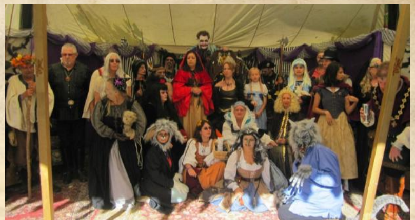
The Cast of Characters at All Hallows Fantasy Faire in Sonora