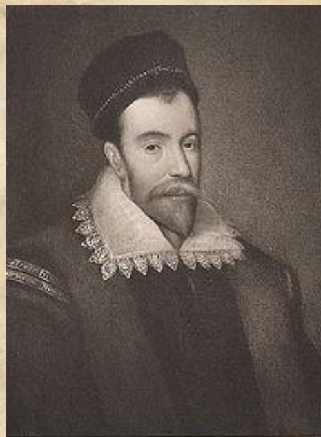
William Maitland of Lethington

The most interesting piece of information my birdies have provided to me is that Sir Maitland is looking for a wife, and apparently is taken with me. We shall see if any of this comes to fruition. T will be interesting.