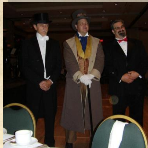
The Men were Dapper!