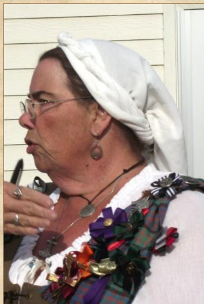
Chieftain has a great many favors—you can see a good sampling of colors and types here

Directions for making the ribbon favors can be found on our website.