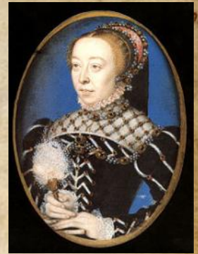
Portrait of Catherine De Medici

Some also claim that she practices witchcraft and that it was sorcery that brought forth her children after being barren for ten years. Mayhaps, it was God's punishment that her sons be so ill and weak. Or mayhaps that was the way she planned it, in order to continue to rule France. It is also said she makes no decisions until she has spoken to an astrologer or before consulting the Tarot. But, this is all just information I have overheard. Do with it what you will. I for one am glad I will not see Madame Snake again.