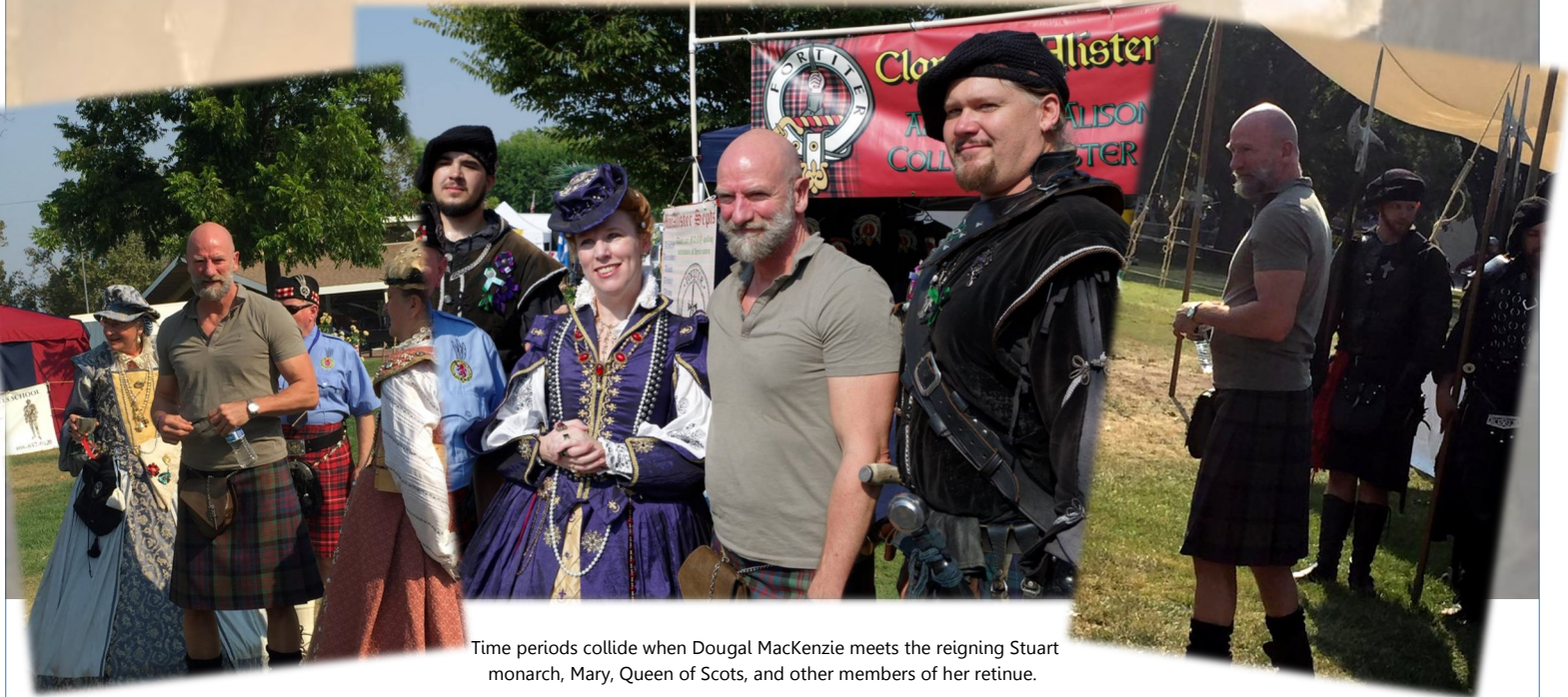
Time periods collide when Dougal MacKenzie meets the reigning Stuart monarch, Mary, Queen of Scots, and other members of her retinue.