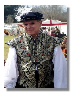
LORD ROBERT NOBLE HOUSE