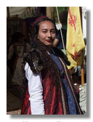
MISTRESS ĀBBY HIGHLANDER HOUSE (Character development in progress)